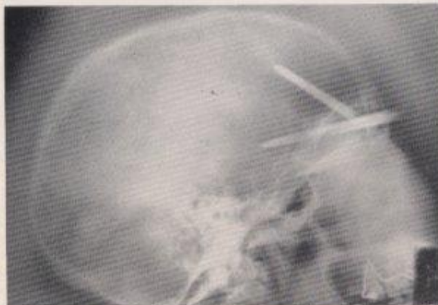
FIG. 5.—Case 490. Superimposed roentgenograms illustrating the range of movement of the orbitoclast within the frontal lobe.